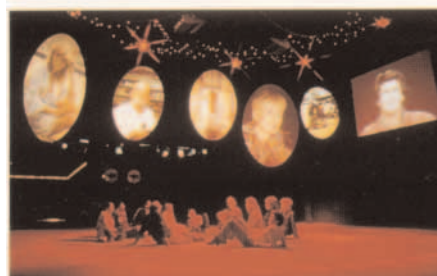
Australian Pavilion, Expo 1986.