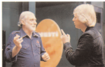
Directing Spike Milligan.

Therefore, superior results are often accompanied by a saving.