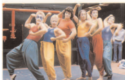
Fringe Theatre documentary.